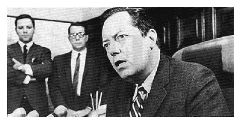
One by one Jim Garrison's witnesses met premature deaths