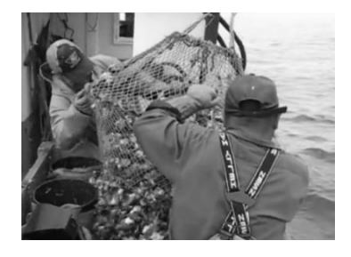
Above [right]: an alternative method for seafloor net trap used for whelk (download mp4: bit.ly/2QJxsNR):

The overwhelming majority of poskim who studied the two sides of the issue, do not wear the techeiles.